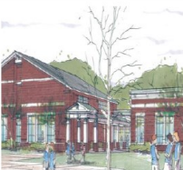
Godley K-8 School, Savannah, GA $24.5m, 180,000-sf; new K-8 School, Construction Manager at Risk for the Savannah Chatham County Board of Education.