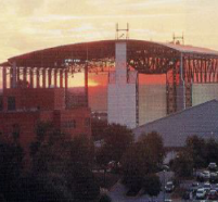
Olympic Aquatic Center, Atlanta, GA $5.6m, 94,000-sf; recreation center with Olympic pool, showers, weight rooms and viewing stands (Whiting/Turner/Polote) for the U.S. Olympic Committee