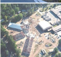
Roy Myers Middle School, Savannah, GA $8m, 75,000-sf; new Middle School, Construction Manager for the Savannah Chatham County Board of Education.