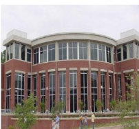
Georgia Southern IT Building, Statesboro, GA $27.5, 49,000-sf; new higher education university technology facility, Construction Manager at Risk for the Georgia Board of Regents.