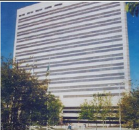
Charlotte-Mecklenburg Government Center, Charlotte, NC $76m, 150,000-sf; new 14-story administrative office building (J.A. Jones/Polote) for the City of Charlotte and Mecklenburg County.

The Polote Corporation combines multiple teaming experiences and decades of experience to successfully design, manage, or construct projects valued in excess of $300 Million aggregate.