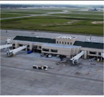
Sav Hilton Head Int'l Concourse Expansion, Savannah, GA $5.2m, 14,000-sf; 1-story masonry and concrete structure (URS/Polote) for Savannah Airport Commission.