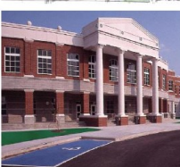
Savannah High School, Savannah, GA 21m, 265,000-sf; 2-story building, classrooms, offices, cafeteria, auditorium, and stand-alone gymnasium for the Savannah Chatham County Board of Education