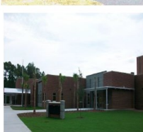
Oglethorpe Academy Charter School, Savannah, GA $21.2 M In new construction 1 story multi wing, gym, offices, and media center