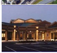
Sol C. Johnson High School, Savannah, GA $16.3m, 122,000-sf; 1-story building, classrooms, auditorium, offices and stand alone gymnasium for the Savannah Chatham County Board of Education