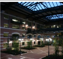
Savannah Hilton Head Int'l Airport, Savannah, GA $20m, Parking Garage.