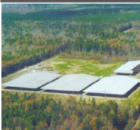
Warehouse Facility, Homestead, FL $2.5, 40,000-sf, 1-story distribution warehouse annexed to commissary for the USACE