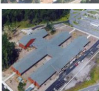
Islands Elementary School, Savannah, GA $14m, 112,000-sf, 1-story, 4 wings, offices, attached gymnasium (Polote/3DI) for the Savannah Chatham County Board of Education