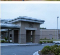
Derenne Middle School, Savannah, GA $8m, 75,000-sf; new Middle School, Construction Manager for the Savannah Chatham County Board of Education.