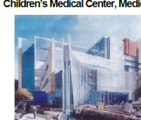
Children's Medical Center, Medical College of GA, Augusta, GA $12.8m, 18,000-sf; complete renovation of medical center