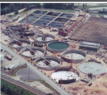
RM Clayton Water Reclamation Plant, Phase II $9m; heavy construction