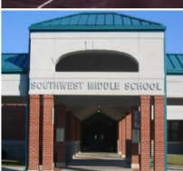
Southwest Middle School, Savannah, GA $8m, 75,000-sf; new Middle School, Construction Manager for the Savannah Chatham County Board of Education.