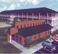
Bachelor Enlisted Quarters, Camp LeJeune, NC $12m, 50,000-sf, 3-story building and amenities building for USACE Savannah District