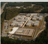
Detention Center & Sheriff's Complex, Savannah, GA $38m, 70,000-sf; new 1,250-bed detention center and administrative complex for the Chatham County Commission.