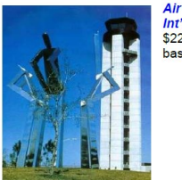
Air Traffic Control Tower, Orlando Int'l Airport, Orlando, FL $22m, air traffic control tower and base building