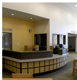
OGLETHORPE Charter School SCCPSS Completed by Turner -Polote $18 M

A Polote team could be selected for its third school in the same district in 3 years. The Polote Corporation has previously managed and or participated in many of the Savannah Chatham County School Public School Systems (SCCPSS) new construction and renovation projects . The SCCPSS has released hundreds of millions in contracts over the last 5 years via it's ESPLOST program. During ESPLOST I The Polote Corporation and its team members were awarded two schools under that first program. Well ESPLOST II has begun and Polote is going for more.