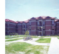
Barracks Upgrade, Ft. Bragg, NC $23m, 150,000-sf, 9 3-story buildings, complete interior demolition and rebuild-out of each unit for USACE Savannah District